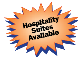
at Holiday Inn DIA