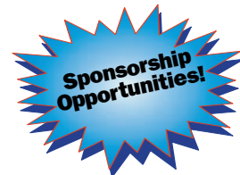
Available at 3 levels!